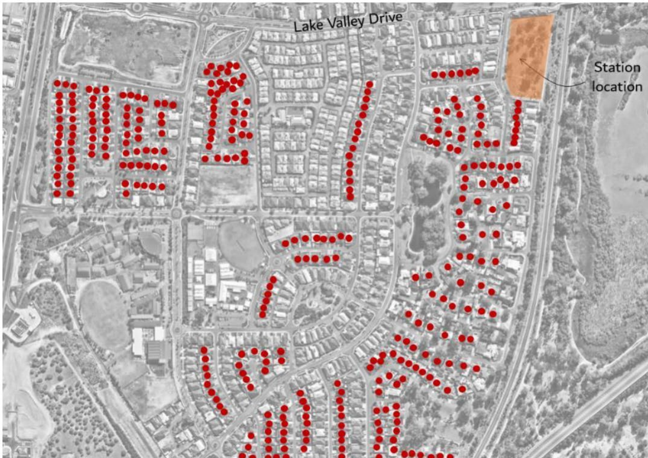
Figure 22 Residences with no adjacent footpath south of Lake Valley Drive

In order to achieve appropriate accessibility via walking and cycling, improvements are required to the footpath network within the 'walkable catchment' including the provision of footpath infrastructure and street trees. Details provided within the development application however, do not indicate any such improvements will be undertaken with the exception of a footpath along Ashwood Parkway and improved connection at the intersection of Lake Valley Drive and Warburton trail.