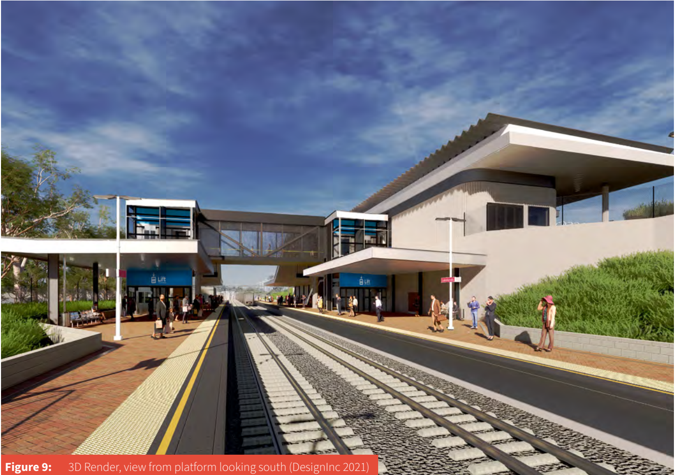
Figure 9: 3D Render, view from platform looking south (DesignInc 2021)