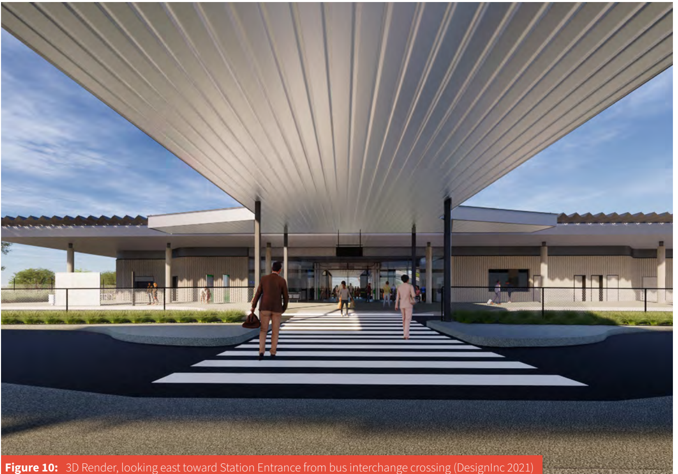
Figure 10: 3D Render, looking east toward Station Entrance from bus interchange crossing (DesignInc 2021)