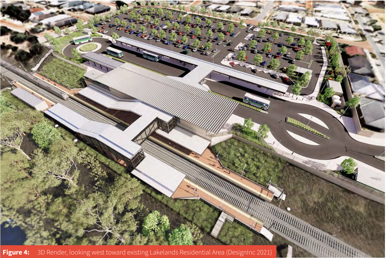
Figure 4: 3D Render, looking west toward existing Lakelands Residential Area (DesignInc 2021)