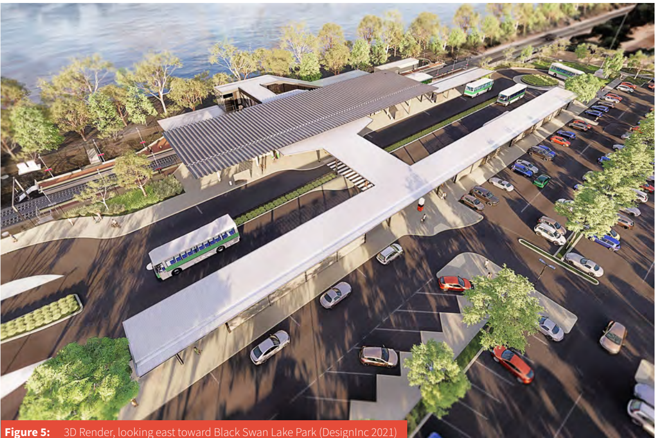
Figure 5: 3D Render, looking east toward Black Swan Lake Park (DesignInc 2021)