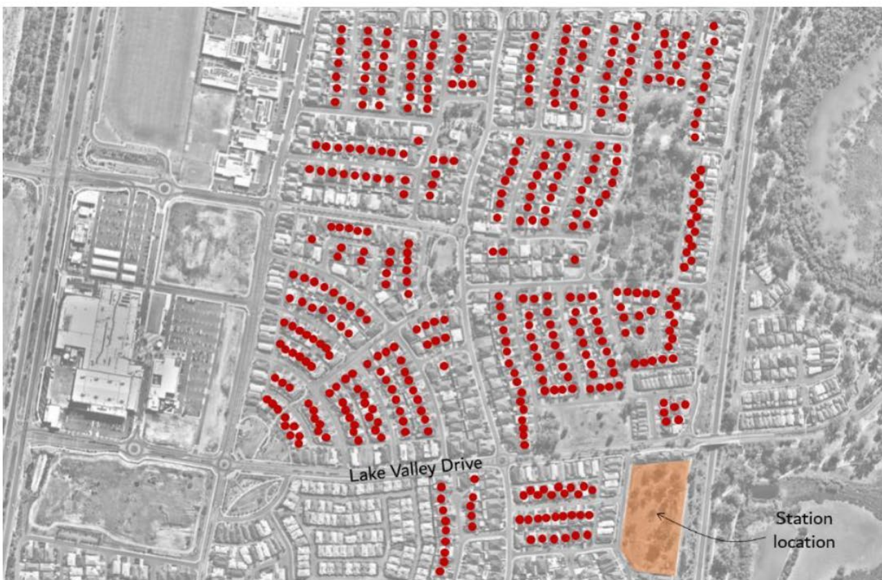
Figure 21 Residences with no adjacent footpath north of Lake Valley Drive

Figures below illustrate this with each red dot representing a dwelling that does not have direct access to a footpath on their verge."